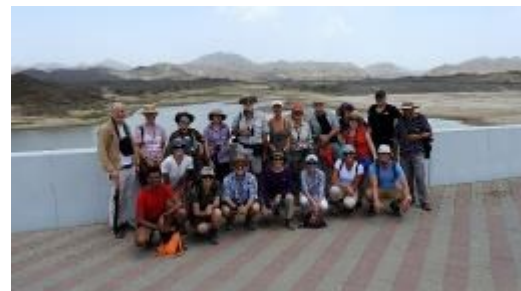
Group photo at a mountain front dam

(6) White-tailed Plovers, which recently lost their best-known UAE breeding site (Dubai Pivot Fields), seem to have taken up at least temporary residence at one wetland site, along with the usual complement of Red-Wattled Plovers/Lapwings – a species that has profited greatly from the continued greening of the UAE over the past three decades.