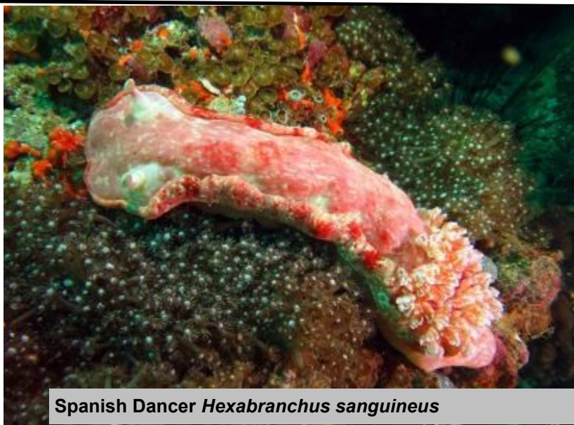
Spanish Dancer Hexabranchnus sanguineus

https://www.youtube.com/watch?v=mv-sbDO2ya0