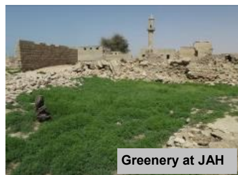
Greenery at JAH