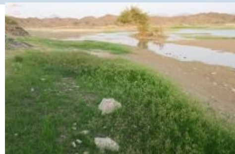
A grove of the sedge Cyperus rotundus , localized at wetland sites