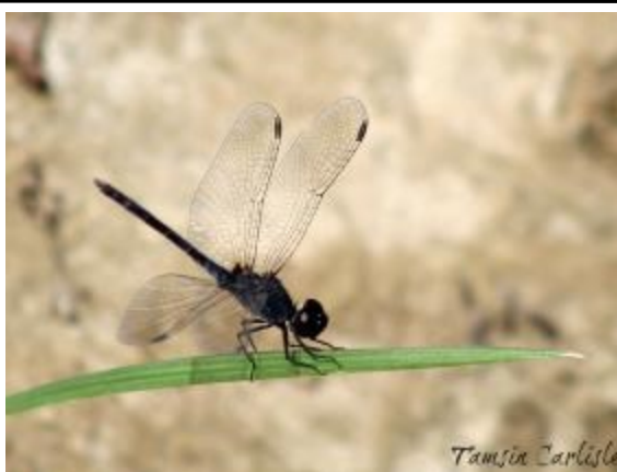
Black Percher/Purple Darter—male Diplacodes lefebvrei