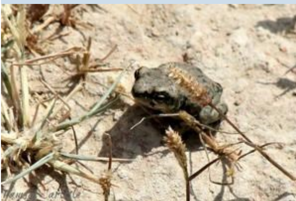
A Dhofar toadlet