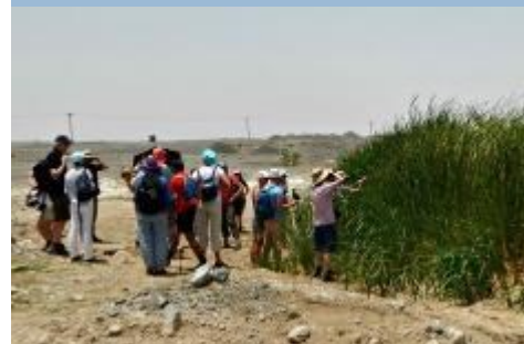
Examining cat-tails ( Typha domingensis ), the remains of a wetland (by Tamsin Carlisle)