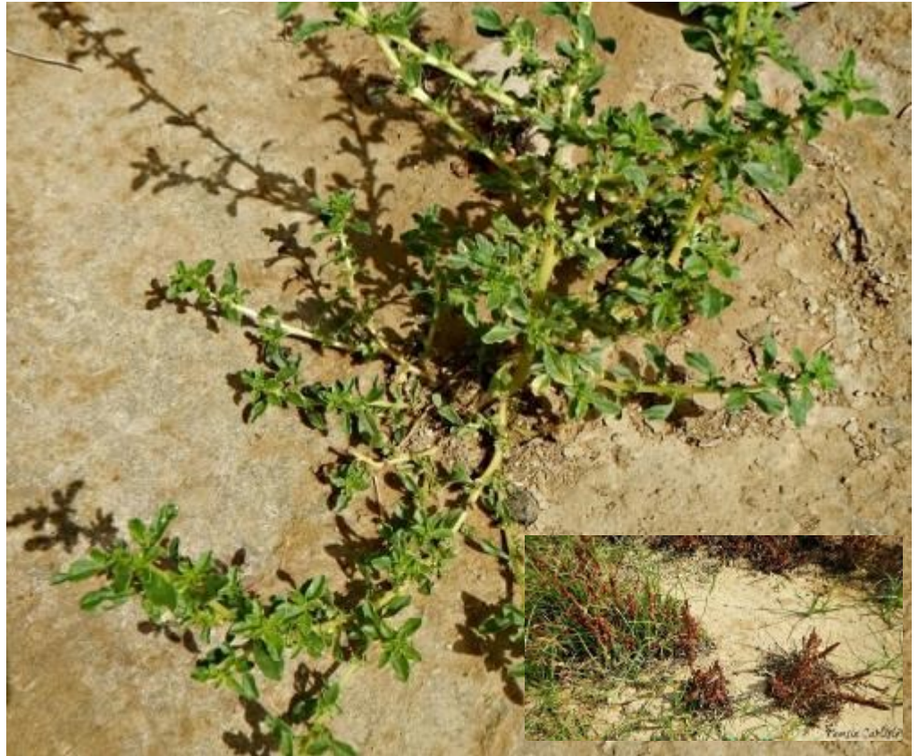
Amaranthus albus in leaf (inset— Amaranthus albus dried)

(1) Two plants generally considered rare in the UAE were abundant in the fine, damp silt around the dams – the sedge Cyperus rotundus and the Amaranth Amaranthus albus . The latter