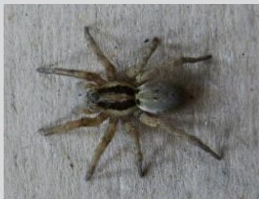
Sleeping Beauty: the paralyzed wolf spider three weeks later

A common spider wasp seen in the UAE is the one shown in the accompanying photo – a relatively large black wasp with shiny, blue-black wings held flat over its body. It spends as much time walking as flying, searching the ground for spiders or spider burrows. It is