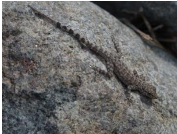
Photo: The Bar-Tailed Gecko Pristurus celerrimus , normally a resident of bedrock outcrops and large boulders in the UAE mountains.