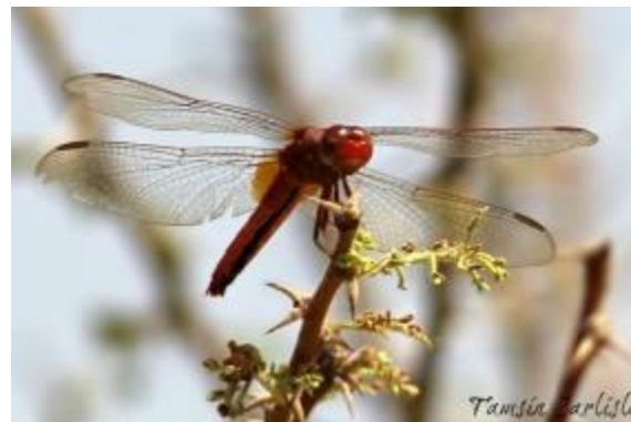
Carmine Darter/Broad Scarlet—female Crocothemis erythraea