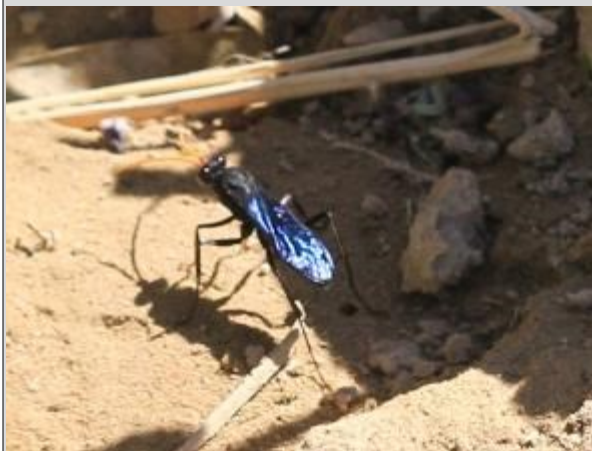
A common large UAE spider wasp (Binish Roobas)