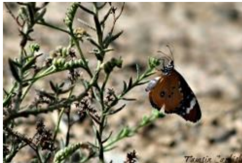
Plain Tiger Butterfly Danaus chrysippus

(3) Hundreds and probably thousands of toadlets of the so-called Dhofar Toad ( Duttaphrynus dhufarensis ) were hopping about from their shelters in the cracked mud surrounding the remaining lake water. Dhofar Toad adults typically live at a distance from surface water, so they must congregate to breed after major rain events, leaving their army of progeny to fend for themselves as the ponds dry up.