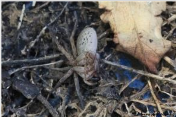
A freshly paralyzed wolf spider ( Hogna radiata ) (Binish Roobas)

Spiders have a reputation as fearsome creatures, both as predators on other animals and because some species can deliver a painful bite to humans. But by most accounts, spiders are nearly helpless in the face of attacks by spider wasps.