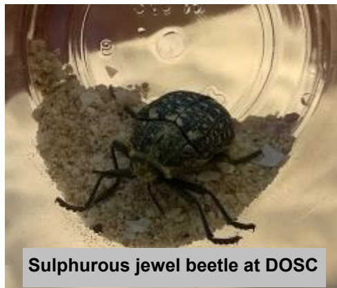
Sulphurous jewel beetle at DOSC

The salt tolerant plant Zygophyllum qatarense was super abundant and I was photographing moths on Heliotropium kotschy when a beady eye below caught my eye and there in all its glory was a sulphurous jewel beetle – Julodis euphratica . But not just one – I found a second beetle in this first bush and a further two in the adjacent area. Then I