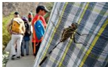
Friendly Dragon Orthetrum sabina