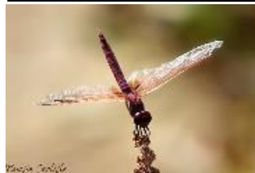
Purple-blushed Darter—male Trithemis annulata