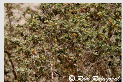
Sidr tree full of fruit