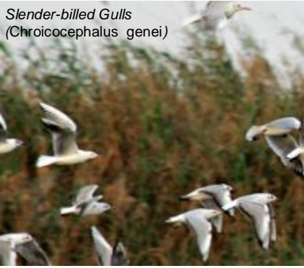
Slender-billed Gulls ( Chroicocephalus genei )