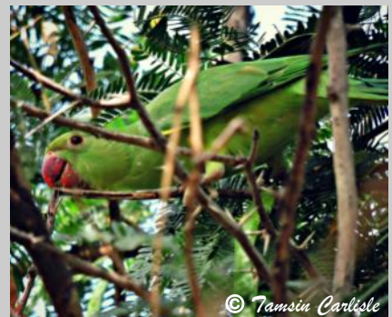
Female Rose-ringed Parakeet