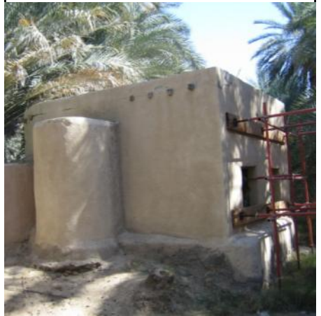
Mosque near Al Ain Oasis

The third mosque near Al Ain Oasis is, according to Dr. Ghava Al Dha-heri from ADACH, 1,200 years old and is one of the oldest mosques in the UAE. It is used only for praying in a small group rather than in the Friday prayer. There is no minaret. Here we have a niche projection on the outside reflecting where the qibla niche is on the inside, which is also seen in the traditional mosques on Delma Island. Again, it is built of mud-brick mixed with stone.