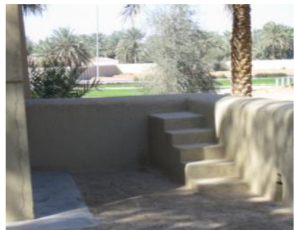
Left to Right: Mosque near Al Jahili Fort; Step Platform