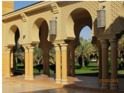
Top left, clockwise: Looking Towards Women's Prayer Area; Entrance to Men's Prayer Hall; Colonnade

The second mosque which we visited is near Al Jahili Fort and is associated with the Fort. It bears a lot of resemblance to traditional mosques preserved on Delma Island. It has a courtyard with a low wall and a little service building, a mosque portico and a single room but no dome. The little step platform is for the Mouazzen (the person who makes the call to prayer). This seems to be similar to what the very earliest mosques in Mecca or Medina were like in the time of the Prophet Mohammed. The roofing material comes from palm and the walls are likely to have been built from mud-brick mixed with stone.