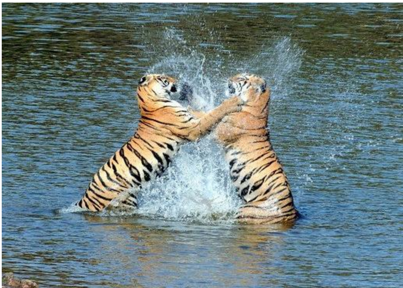
Tigers in the Tadoba-Andhari Tiger Reserve.