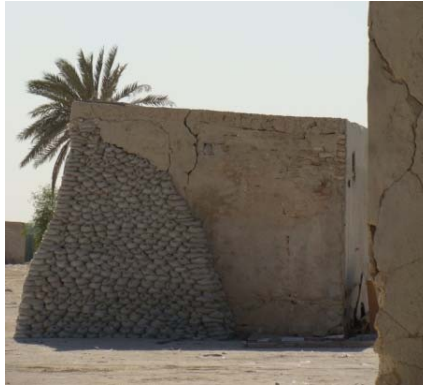
Successful temporary support of sandbags

dence. Sadly much of the fishing village has been quite comprehensively demolished and it is still being decided how much restoration of this area will actually take place.