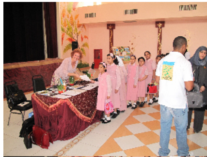
Environmental education session

As a result, and despite the continuous efforts of KTCP team members, the turtles were monitored but not flipper or satellite tagged to the desired extent. Hatching information about the marked green turtle nest of August 15 th is hopefully to be provided soon, when the nest is dug out by researchers and the i-buttons retrieved.