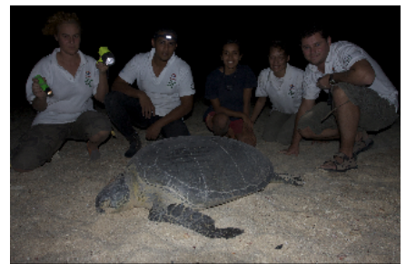
Observing a turtle on the beach

In order to responsibly mark the beginning of the nesting season, teams began visiting the islands as early as March 2009 and their most recent field trip was carried out in the beginning of October. Monitoring was done with dedication and discipline, the teams working on land and in the water, sometimes around the clock with little or no sleep, all members sharing the same determination to decipher the turtles' foraging, mating, nesting and hatching habits on the islets as well as the careful description of their beach and marine ecosystems.