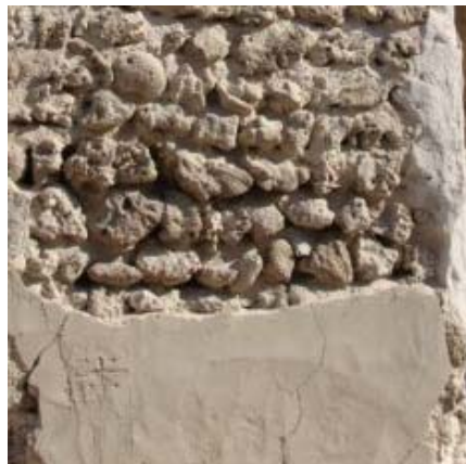
Carefully wedged coral blocks, plastered together and faced

made of wood. Construction techniques used in historic Sharjah buildings reflect the available materials, the architectural style of the time and the builders who were concentrated in certain families. Many walls were formed using compacted coral, cut into large chunks that were mined from offshore islands. A mixture of lime, sea sand and gypsum acted like glue to hold the large seastone pieces together and the mass was gradually shaped into a wall.