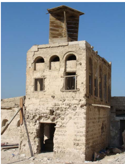
Wooden wind tower, Bait Bin Jarsh

Sharjah, means 'rising sun' and its history goes back more than 6,000 years. The people of historical Sharjah made their living through maritime trade, farming, goat-herding, hunting, pearling and fishing. The town began in the early 1500s as a fishing, maritime, farming and trading centre, and these occupations persist today.