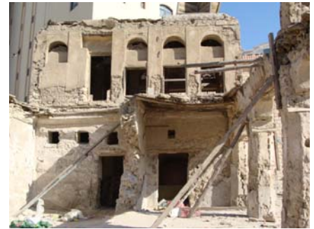
Bait Bin Jarsh awaiting restoration

from India were more commonly used than chandals.