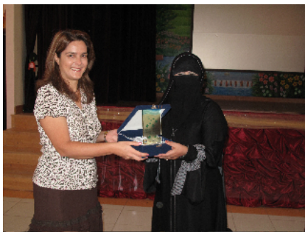
Community involvement is important

till the end of June. Then, after a long pause of three months, researchers discovered another pit, which was probably a nest, in October. As we've suspected since last year, hawksbills in Kuwait seem to have two nesting seasons, an "early" and a "late" one, at least in Umm Al-Maradim. This year, unlike last, hawksbills nested in Qaru island as well. Nesting season here began at the end of May and continued throughout the month of June with eleven pits in Qaru. In both Qaru and Umm Al-Maradim, none of the hawksbills was seen nesting by the team. With the cooperation of the Coast Guard, however, some photos and a video were shown to the team, clearly demonstrating hawksbill turtles nesting. Further proof of hawksbills nesting in Qaru was given to KTCP in both July and August, with one dead hawksbill hatchling found on each of two different beaches during morning surveys. As no nesting females were encountered throughout the nesting season, no satellite transmitters were attached and it was decided to satellite tag green turtles during their own nesting season on Qaru island. An adult male hawksbill was encountered in near shore waters in Qaru in both July and August, seemingly foraging. It was the same animal both times, as photography has revealed.