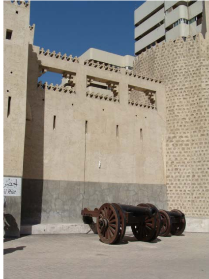
Al Hisn, Sharjah

would sleep during the hot summer season. Instead of wind towers, hidden shafts, known as wind scoops (baadkash) captured breezes from the roof and directed them into the lower ground level through a double section of wall, thereby supplying the ground level rooms with cooler air.