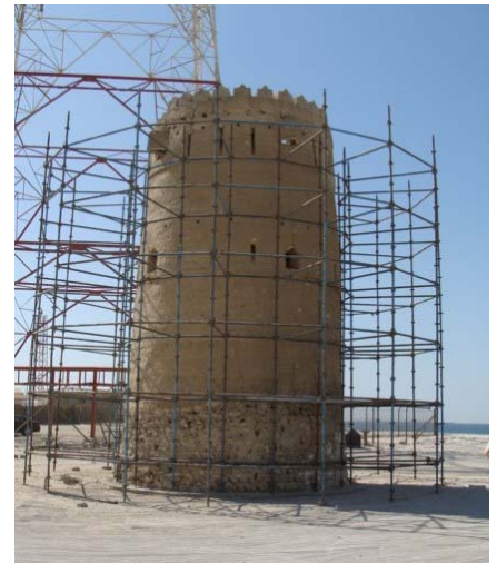
Watch tower, Al Khan fishing village

Our final visit was to the Al Khan fishing village which until 2003 was still inhabited, though demolition of this area started some thirty years ago. Today only two watch towers of the many watch towers originally constructed in this area remain. One has been restored and the other is in the process of being restored.