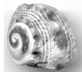
A specimen of Lunella