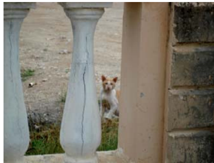
The buildings are abandoned but the cats remain at Mughsail Beach, Oman

tion. According to Skinner & Smithers (1990) and Griffin & Simmons (1998), the African wild cat ( Felis lybica – conspecific with F. silvestris from Arabia) interbreeds with the domestic cat where they come into contact. This results in fertile hybrids (Bothma 1996) and possibly the decline of pure-bred African wild cats anywhere near settled areas, rendering the species vulnerable (Smithers 1986). The fate of F. silvestris from Arabia is probably similar. Harrison & Bates (1991) state that great difficulty is experienced in differentiating between domestic cat and Wild Cat in Arabia. This could indicate historic interbreeding with the possibility that little if any genetically "pure" Wild Cats remain locally. This would however have to be determined genetically.