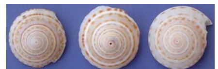
Architectonica sp.