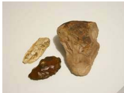
Flint axes, scrapers / knives?

In an area where a number of large marine mammal fossils have been found we wandered off the 'newly paved' road 200 meters and found some large shell fossils, including gastropods and sea urchins. Those in perpetual lizard mode spotted several Sinai agamas Pseudotrapelus sinaita , including a brightly marked juvenile.