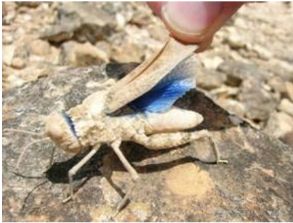
Male Omania splendens , a Dhofar endemic

This region is a raptor paradise for bird watchers in the right season. We were out of season but did manage at least 4 species, tentatively identified as kestrels, steppe eagles, lappet wing vulture and a very large dimorphic eagle pair. One was dark brown with white slightly mottled breast and the other tawny brown – any ideas anyone?