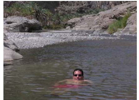
Keeping cool in a wadi near Al Suwaidi

Snorkelling at Snoopy Is. Shelling at Suwaidi beach You can stay at the resorts in Fujairah or at Al Sawadi in Oman for discount prices during the summer months. The air temperature is often 5C cooler on the other coast and the sea temperatures much nicer. Snorkeling at Snoopy Island always reveals many varieties of tropical fish and I have always been fortunate to view sea turtles and the occasional small reef shark. Several wadis easily accessible for day trips from Al Sawadi nearly always have running water in the summer, attracting wildlife and offering opportunities for great photos.