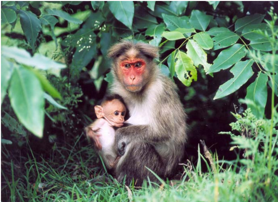
Tales of Summer Escapades