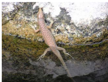
Water lizard or hot lizard?

We did begin our walk early in the morning and stayed in the shade of the steep wadi side walls when we could. As always in Arabia, we carried plenty of water, half of it frozen in plastic bottles, first aid supplies, proper clothes, hats, and sunblock.