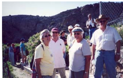
In the rose gardens, Saiq, 2004

This seemed like a casual promise, but if he does it, don't casually sign up. These walks are for the fit. Details in the next issue of Gazelle .