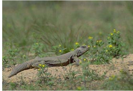
Uromastix aegyptius microlepis (from www.uaeinteract.com , the web site of the UAE Ministry of Information and Culture)

tubercles (scaly bumps) along the sides of the body. Peter adds that the colour pattern of juvenile U. leptieni differs from that of U.a.microlepis – "reddish brown to dark brown with a dark brown to black reticular pattern; no yellow "spots".