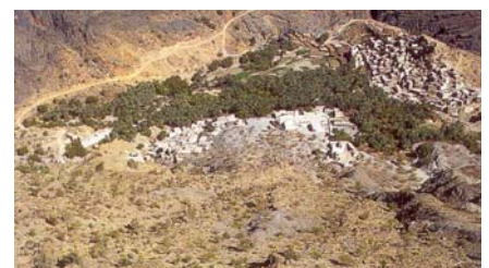
Bilad Seit from near Sherif al Alamein