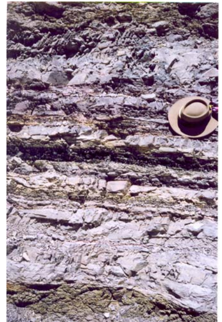
The upper black line

(Ed.: When we went up to the cutting the first time, there were two black lines, one at chest level, and one at ankle level. Somewhere, I have a photograph of this. The lower line is now covered by a layer of rubble, but it might be interesting to dig the debris away and determine the composition of the two layers and whether they are the same material.)