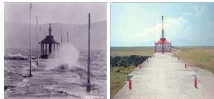
The pier in 1976 ... and in 2002

These two photographs are from a website called www.amigosdelago.org but many sites relating to conservation issues can be found online, the most interesting being www.earthobservatory.nasa.gov/Newsroom .