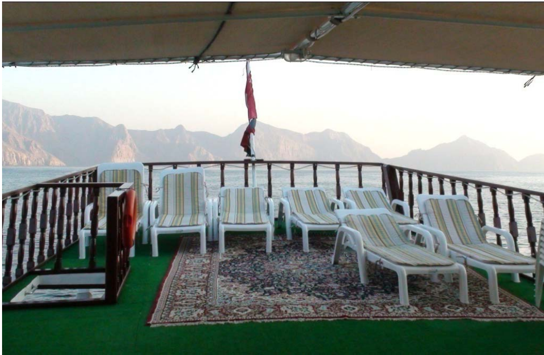
Top deck with sun lounges