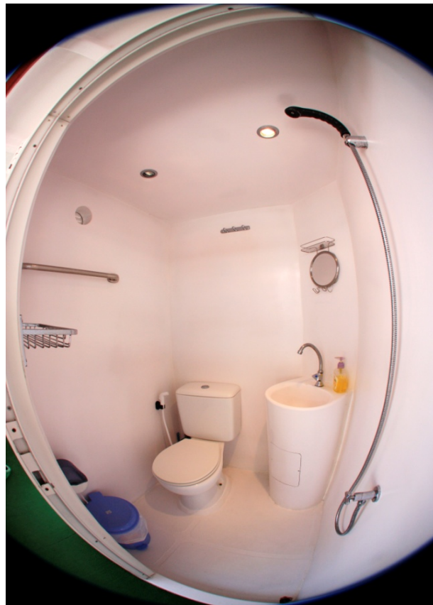
Bathroom with toilet and shower