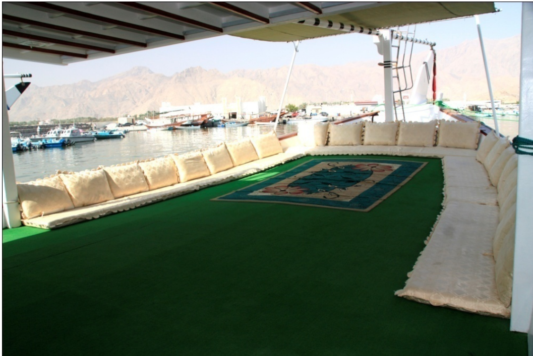
Traditional Arabic seating