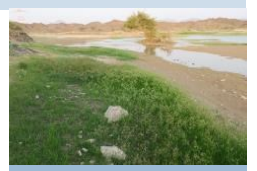
A grove of the sedge Cyperus rotundus, localized at wetland sites