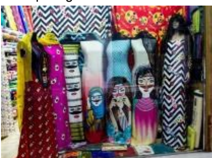
Fabric shop in souk