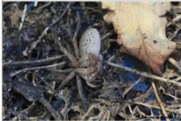
A freshly paralyzed wolf spider (Hogna It spends as much time walking as radiata) (Binish Roobas)

C piders have a reputation as fearsome creatures, both as predators on other animals and because some species can deliver a painful bite to humans. But by most accounts, spiders are nearly helpless in the face of attacks by spider wasps.