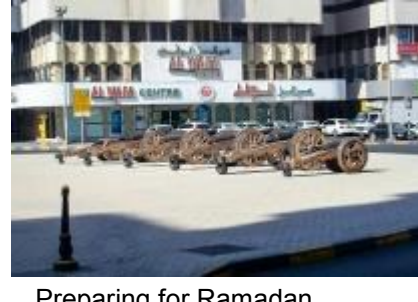
Preparing for Ramadan