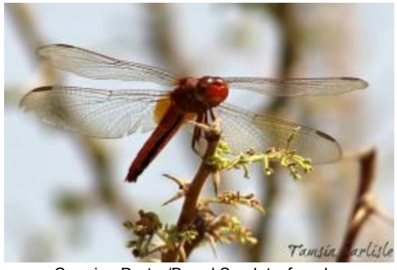
Carmine Darter/Broad Scarlet—female Crocothemis erythraea