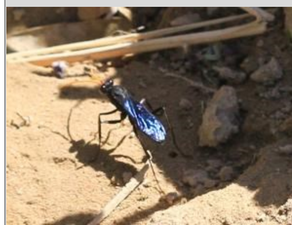
A common large UAE spider wasp (Binish Roobas)