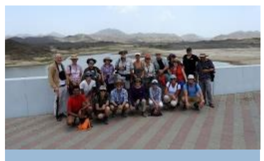
Group photo at a mountain front dam

(6) White-tailed Plovers, which recently lost their best-known UAE breeding site (Dubai Pivot Fields), seem to have taken up at least temporary residence at one wetland site, along with the usual complement of Red-Wattled Plovers/Lapwings – a species that has profited greatly from the continued greening of the UAE over the past three decades.