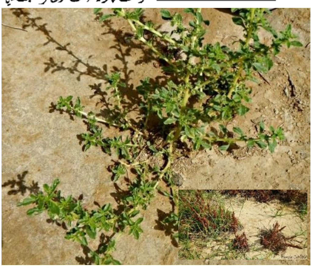
Amaranthus albus in leaf (inset—Amaranthus albus dried)