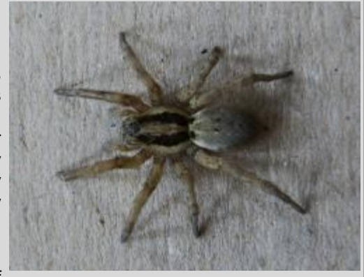
Sleeping Beauty: the paralyzed wolf spider three weeks later (G Feulner)

A common spider wasp seen in the UAE is the one shown in the accompanying photo - a relatively large black wasp with shiny, blueblack wings held flat over its body. flying, searching the ground for spiders or spider burrows. It is