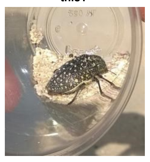
Find out on page 4