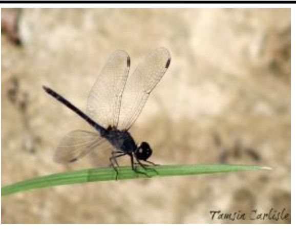
Black Percher/Purple Darter—male Diplacodes lefebvrel