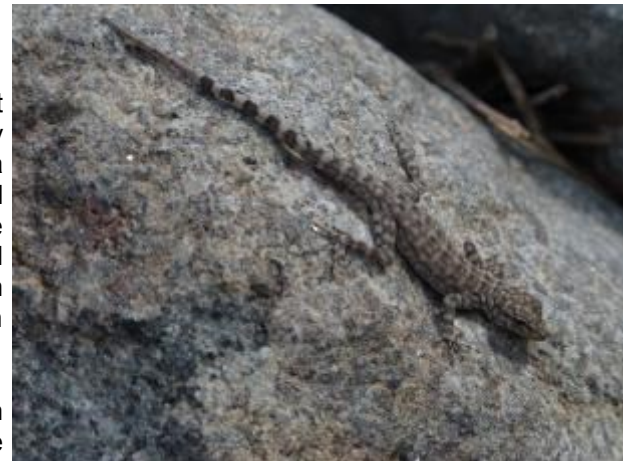
Photo: The Bar-Tailed Gecko Pristurus celerrimus, normally a resident of bedrock outcrops and large boulders in the UAE mountains.

Only time will tell if this was an isolated incident or if, perhaps, a population will establish itself at this upscale seaside location. But the gecko(s) may be adapting rapidly. Although they are normally daytime hunters, the one observed was active after dark, and Binish had the impression that it might have been relying heavily on insects attracted by the nearby roadside lighting.