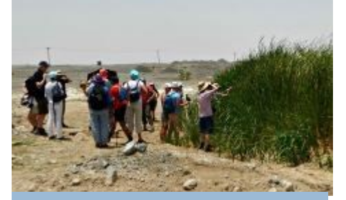
Examining cat-tails ( Typha domingensis ), the remains of a wetland