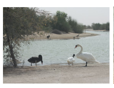
Al Qudra Lakes during May