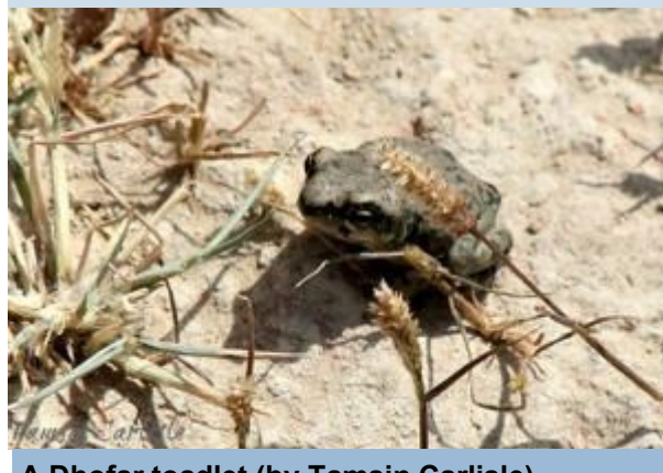
A Dhofar toadlet