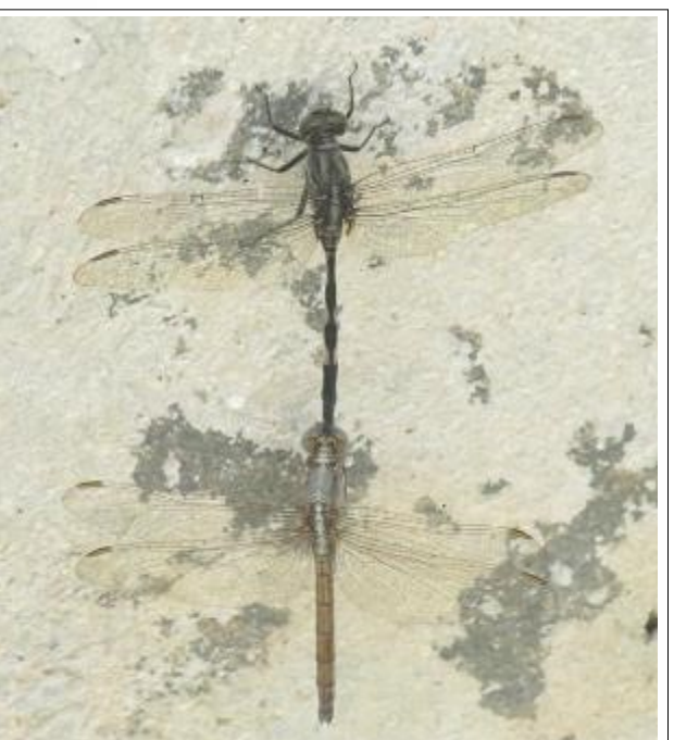
An unconsummated attempt to mate by a male Slender Skimmer Orthetrum sabina (top) with a female Gidled Skimmer Orthetrum chrysostigma

male grasps the female by the head and neck (pronotum) with his anal claspers, located at the tip of his abdomen. The female then bends her abdomen forward and upward, so that her genital opening, near the tip of her abdomen, touches the secondary genital opening of the male, on the underside of his second and third abdominal segments, from which she will receive stored sperm.