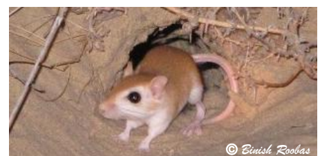
Cheesman's Gerbil emerging from its burrow despite the presence of observers nearby