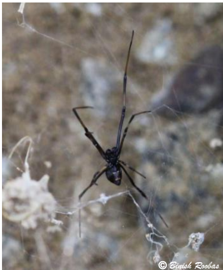
The male redback is much smaller and less conspicuous than the female