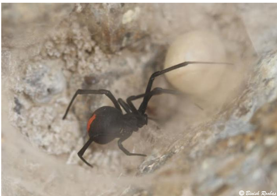
A female redback and her spherical egg case, found in a remote tributary of Wadi Wurayah

We learned subsequently that a redback spider had been observed at the waterfall area in Wadi Wurayah just a month previously, but the waterfall was until very recently an extremely popular picnic area and the spiders there could have been introduced with human vehicles or firewood or other supplies. A check of the area quickly revealed (to Binish, anyway) a small web with a male redback, much smaller and less conspicuous than the female.