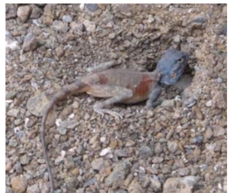
Caught in the act? A female Sinai Agama, apparently excavating a hole