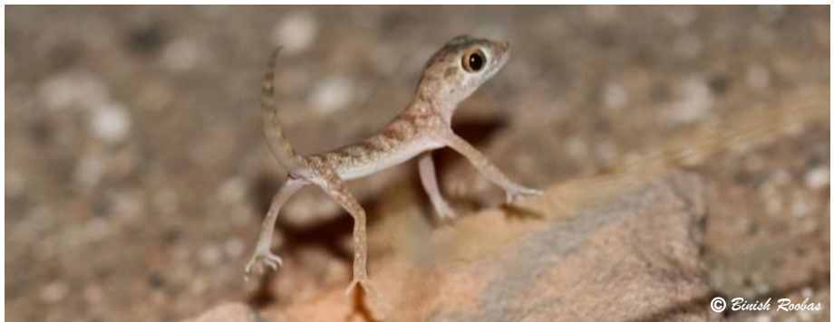
A flying gecko! Slevin's Dune Gecko reacts instantaneously to the camera's shutter and flash

We learned, in particular, that gerbils have very, very fast reactions. Binish had set up a camera on a tripod about 2 meters from the burrow entrance. Most of the time we could see the gerbil within the sloping burrow and it emerged at regular intervals (of less than a minute), despite our presence and despite our lights. At the burrow mouth, it