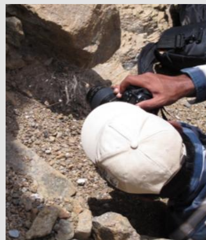
Binish photographs the untidy web of the female redback

So it was of special interest when, in mid-May, we found a redback and its web, complete with egg case(s), a couple of hours up an obscure wadi within Wadi Wurayah National Park. Credit goes to Binish, who has