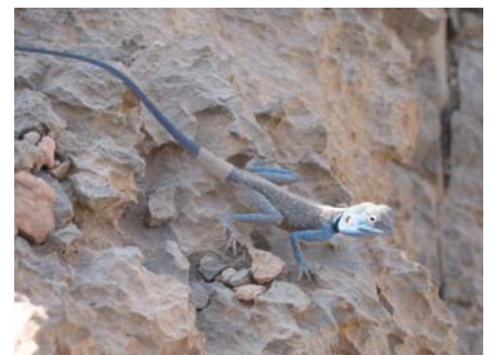
Male agama with banded tail