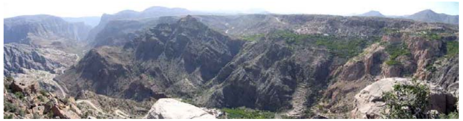
Al Ayn, one of the Saiq Plateau's many beautiful villages that DNHG members have visited

As yet no field trips have been scheduled for the coming season, but many ideas are afloat. Please think about interesting places or things that you know of, that others would enjoy, and contact the Field Trip Coordinators with your ideas, offers, or wish lists.