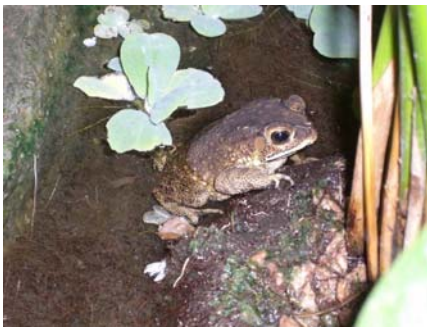
The Sufouh garden toad