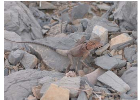
Female agama with banded tail

nomenon not previously highlighted in the blue rock agama, Pseudotrapelus sinaitus : a colourless patch at the base of the tail, seen during the past summer on animals at two sites.