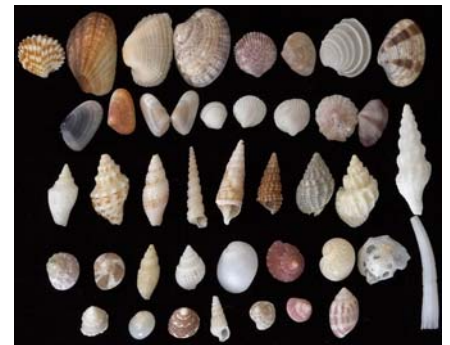
The biggest, Dentalium octangulatum (SEA,#865), bottom left, is 24mm long

Unfortunately, the beach is marred by increasing amounts of flotsam, jetsam and beachgoers rubbish, and the Municipality has taken to sweeping the beach with a machine in the mornings. In the late afternoons, it is torn up by quadbikers. If you want to see or collect shells, you are best to go to the beach very early in the morning after a good on-shore blow. Be prepared to do your collecting on hand and knees, and perhaps take a magnifying glass to see that your specimens are undamaged. As Sandy Fowler says, don't assume there's nothing of interest until you have got down and looked. Sandy also recommends taking a plastic bag of shells and sorting through them at home, if the weather is too hot to make shelling pleasant, returning the rejects on your next collecting trip. Report by Anne Millen