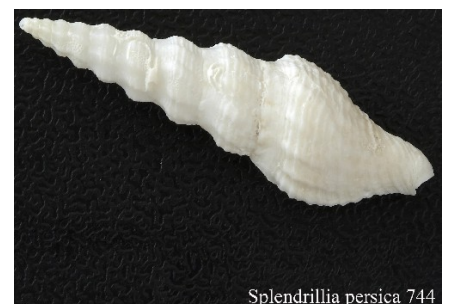
Splendrillia persica 744