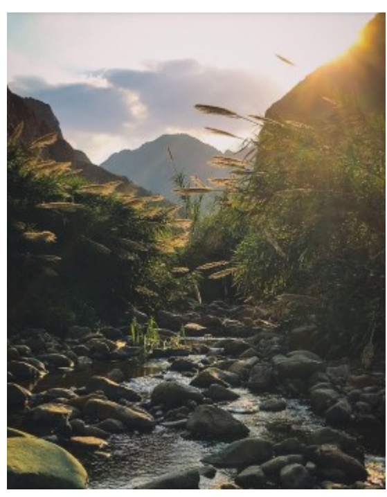
Category: Landscape (Winner: Sami Ullah Majeed)

Category: Art—Drawing (Winner: Rakhi Sawalani)