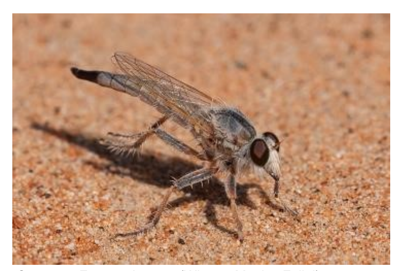
Category: Fauna—Insects (Winner: Monica Falini)