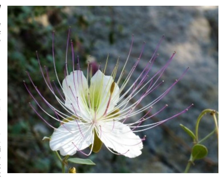
Category: Flora—photograph of a Caper flower Capparis spinosa (Winner: Angela Manthorpe)