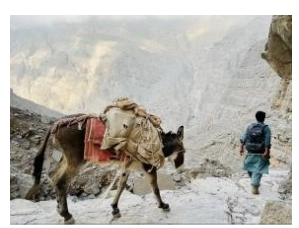
Category: Culture (Winner: Sandi Ellis)