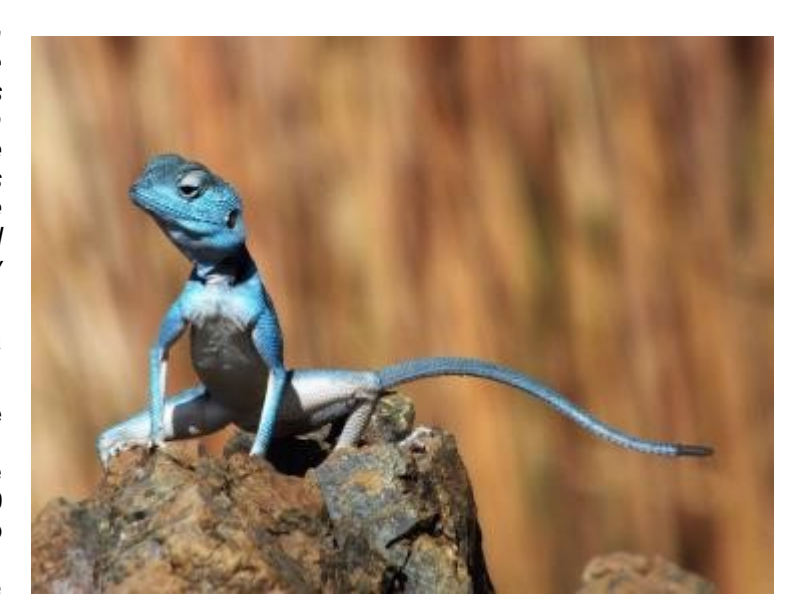
Category: Fauna—Reptiles—photograph of a Rock Agama Pseudotrapelus jensvindumi (Winner: Angela Manthorpe)