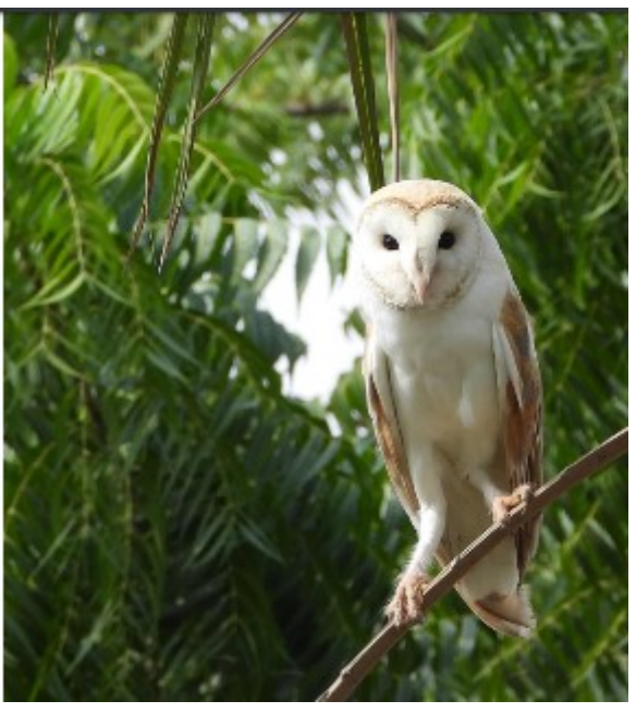
Category: Fauna—Birds (Winner: Sami Ullah Majeed)